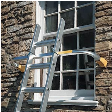
Stabilizer bar attached to an extension ladder.

In 2007 and 2008, falls from an elevated level accounted for 13% of our total workers' compensation claims within PestSure.