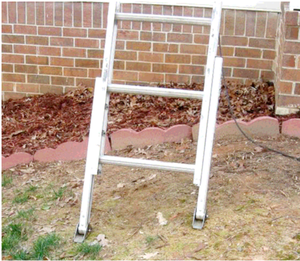
Auto leveling cleat in use on an extension ladder.